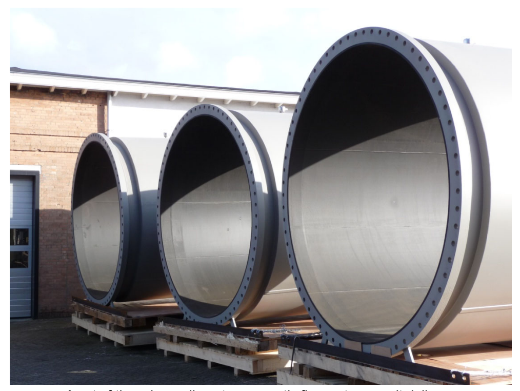
A set of three large diameter magnetic flowmeters await delivery.