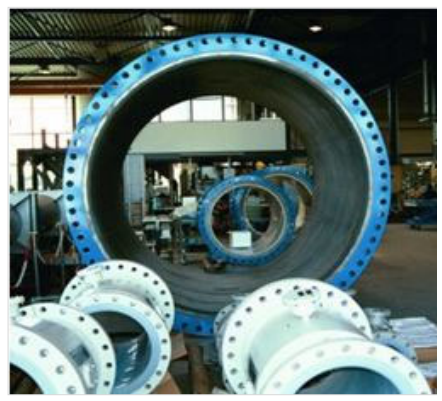
Magnetic flowmeters

Magnetic flowmeters, first commercially produced in the 1950s, now generate more revenues worldwide than any other type of flowmeter. More than 60 suppliers worldwide now