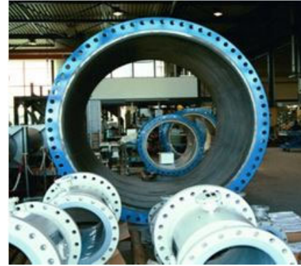
Magnetic flowmeters

Flow Research is excited to announce a new market study on the worldwide magnetic flowmeter market called The World Market for Magnetic Flowmeters, 7 th Edition . The study determines the size of the worldwide market in 2019 and 2020, forecasts the market through 2024, covers a variety of market segments, and provides market shares of the major suppliers.