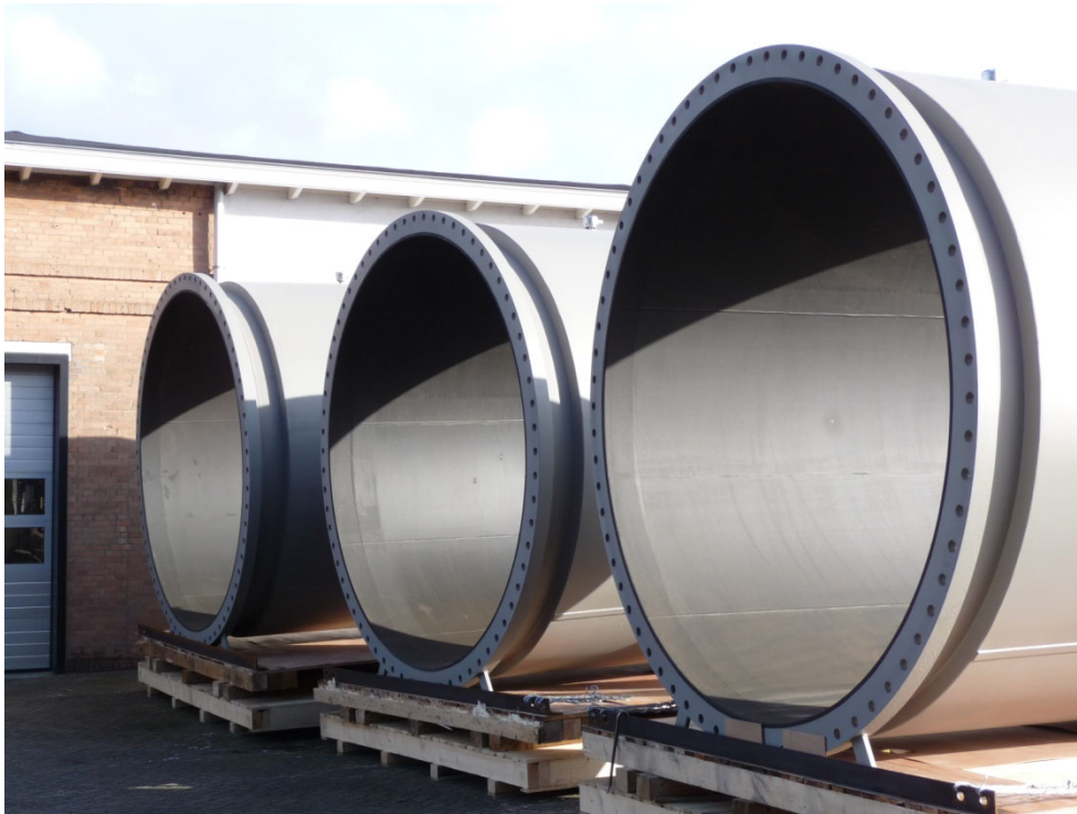
A set of three large diameter magnetic flowmeters await delivery.