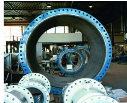
Photo of magnetic flowmeters from the Flow Research archive