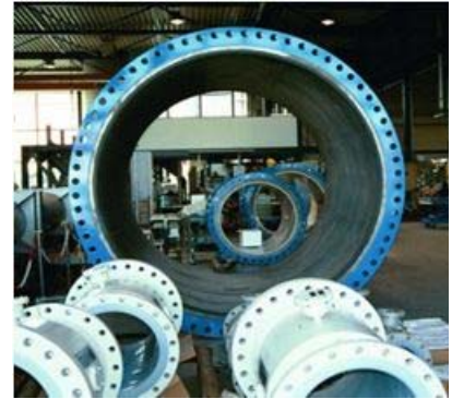
Magnetic flowmeters.